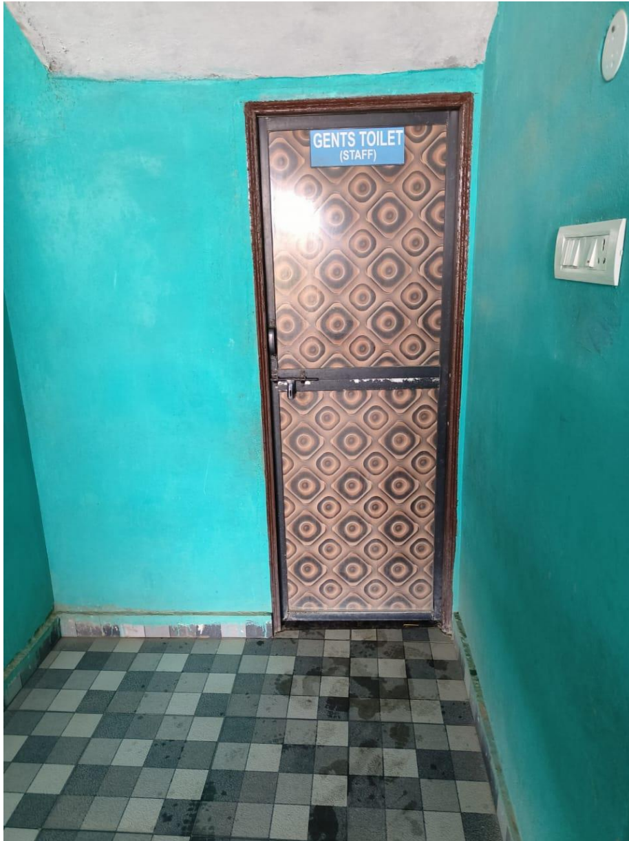
Gents Toilet Room